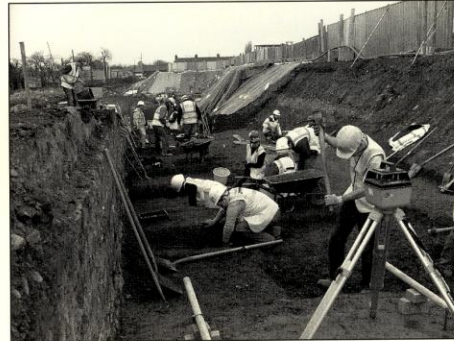
Archaeological excavations at Highhayes, MacDonagh railway station 2006. A previously undocumented artisan's quarter of the medieval city was revealed, including a pottery production centre and a baker's yard

Britain and on the continent, and it is this dynamic blend that defined the ancient city and whose legacy continues to this day in its built form.